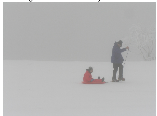
Rachel Owen on the toboggan

Reaching the Summit of Mt.Skene about 4 ½ hours from the camp site we realized that to head back, through the same and potentially time consuming terrain it was likely to be well after dark.