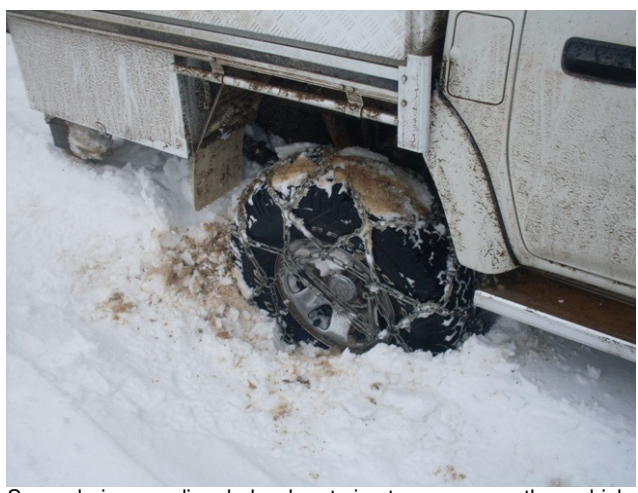
Snow chains can dig a hole when trying to recover another vehicle

Reaching the turnoff just on dark, and finding a new seasonal road closure gate, the plan was quickly amended to dinner at the Jamieson Pub where we could work up a plan.