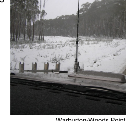
Warburton-Woods Point Rd

After travelling in snow covered roads for about 2hours, we reached Connors Plain camp ground. The camp area was covered in snow. The plan was to head upto Mt.Skene summit and then return to the camp ground for the night. Last year, the journey upto Mt.Skene summit took about 30minutes.